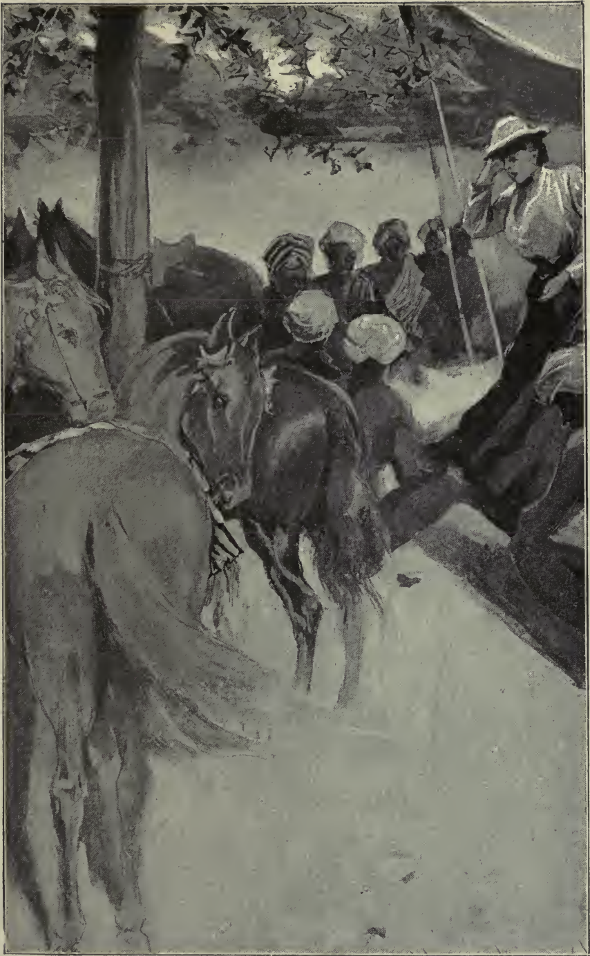
PONIES SNAPPED AND SQUEALED AT EACH OTHER